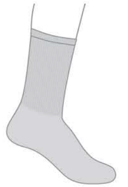
CREW HITS AT CALF TO MID CALF